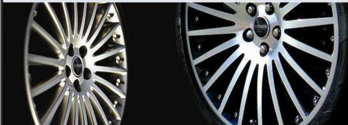
CARBON DIAMOND TURNED

Wheels are supplied fitted with high quality Dunlop SP Sport Tyres