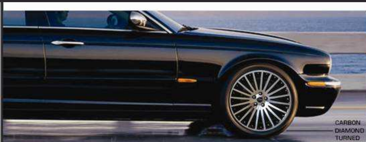
CARBON DIAMOND TURNED